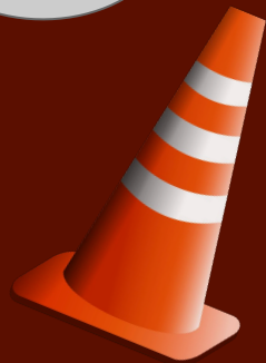
Trevor Williams, Fifth Grader

Honest (September) Ambitious (October) Reliable (November) Dependable (December)